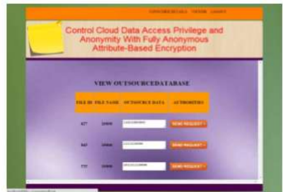
Fig 4. Consumer database