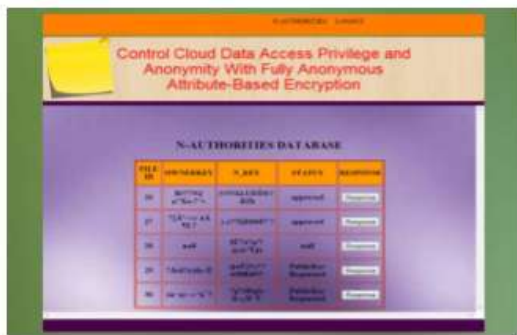
Fig 2. Show n-authorities database

Attribute based encryption is using data uploaded. This is each and every node encrypted data in store. Fine-Grain concept using encrypted data convert into binary value fully secure for database.