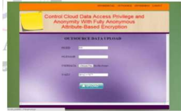
Fig 3. Database upload