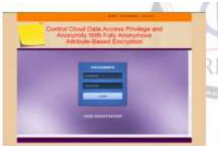
Fig 1. Login form

Data Access The Data can be accessed by viewing the content of the file or downloaded